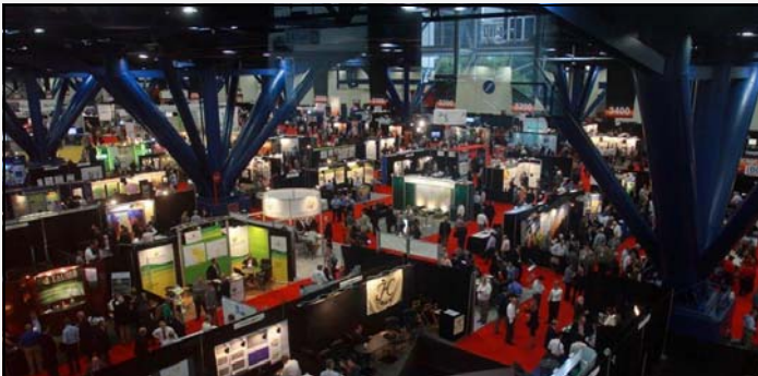
View of 2014 Summer NAPE in Houston, Texas